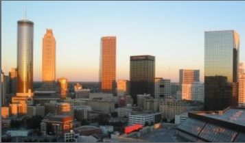
iHT 2 Health IT Summit in Atlanta April 24-25, 2012 Atlanta, GA