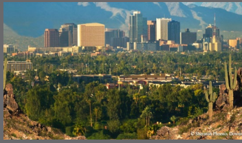
iHT 2 Health IT Summit in Phoenix January 18-19, 2012 Phoenix, AZ