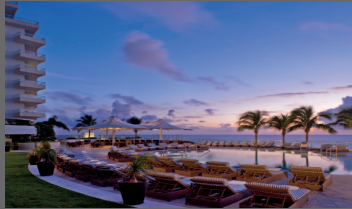
iHT 2 Health IT Summit in Fort Lauderdale June 12-13, 2012 Fort Lauderdale, FL