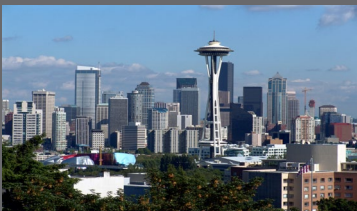
iHT 2 Health IT Summit in Seattle August 22-23, 2012 Seattle, WA