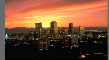
iHT 2 Health IT Summit in Denver July 24-25, 2012 Denver, CO