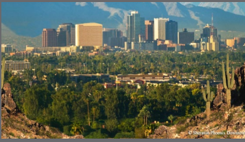
iHT 2 CMIO Forum in Phoenix January 17-18, 2012 Phoenix, AZ

Please join us by becoming a partner in the innovative work of driving improvement in our healthcare system through the effective use of technology across the continuum of care.