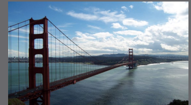
iHT 2 Health IT Summit in San Francisco March 27-28, 2012 San Francisco, CA