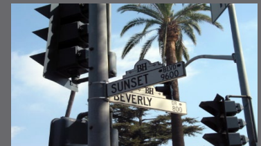
iHT 2 Health IT Summit in Beverly Hills November 7-8, 2012 Beverly Hills, CA